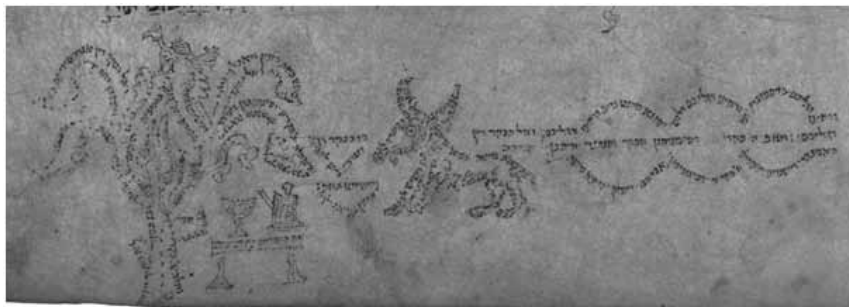
Figure 6: MS Vatican, BAV, Vat. Ebr. 14, f. 17r (bottom of the folio).

The biblical passage in fol. 17r goes from Gen. 17:23 to 18:8 (i.e., the beginning of Parasha Vayyera in Gen. 18:1).