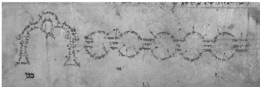
Figure 4: MS Vatican, BAV, Vat. Ebr. 14, f. 16v (bottom of the folio).

The biblical passage in fol. 16v is from Gen.17:10 to 17:23 (end of Parasha Lekh lekha ).