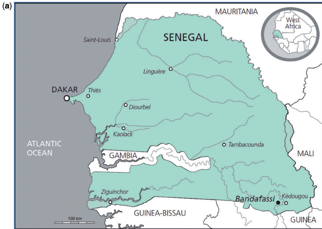
Figure 1a. Location of Bandafassi HDSS in Senegal.