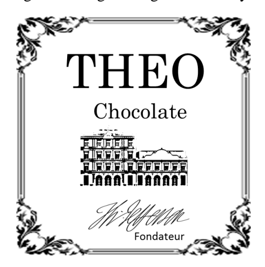
Figure 3 - Logos designed for Study 2 (Brand heritage condition on the left)