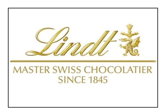
Figure 2 - Lindt Logo