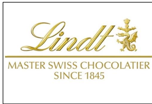
Figure 2 - Lindt Logo