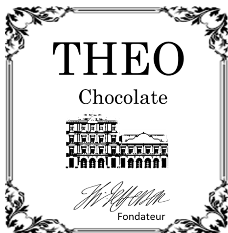
Figure 3 - Logos designed for Study 2 (Brand heritage condition on the left)