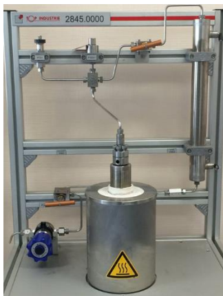
Figure 1. Experimental apparatus

The aims of this work is to experimentally treat asbestos containing waste. First, an experimental assessment method is developed to qualify the performance of hydrothermal process. Then, a parametrical study is realized to determine influence of temperature, pressure, treatment duration, concentration and variety of asbestos (Table 2).